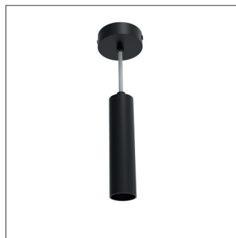
TUBE 40 PND