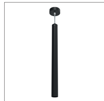
TUBE 40 L PND